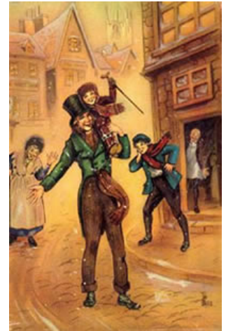
A Christmas Carol by Charles Dickens

Where: Melbourne Area Board of Realtors Auditorium - 1450 Sarno Road, Melbourne (across from the Brevard County Service Complex)